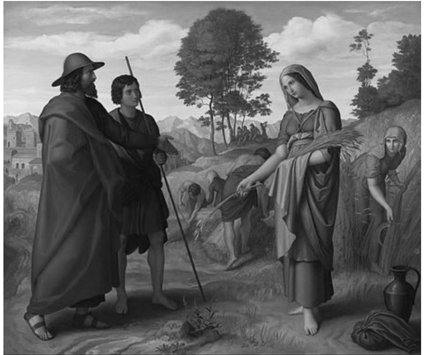
Julius Schnorr von Carolsfeld: "Ruth in Boaz's Field", 1828

We hear in 2 Timothy 3:16 that all scripture is God-breathed and useful for teaching and training for righteousness and the reference here would have been primarily to what we consider the Old Testament at the time of the writing. We ignore the rich narratives and instruction of God’s holy word in the OT at our own peril and won’t fully enjoy the New Testament writings, which often refer, allude to, and presume a knowledge of the OT. While we won’t get that all by going through only the Book of Ruth, we will get a greater sense of redemption and our Triune God as we look at this scripture.